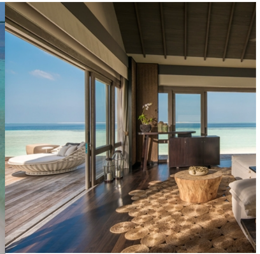
Beach Villa master bed

Arrive by a private seaplane to the secluded island with only 7 villas hosting up to 22 guests