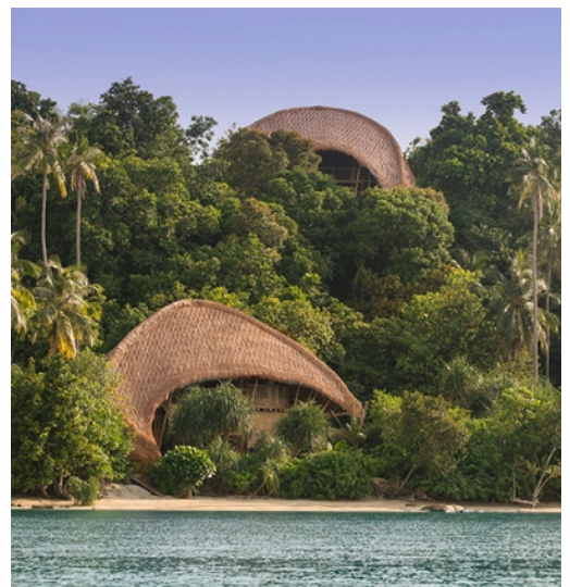
Bamboo villas surrounding Cem

Housing a maximum of 40 guests with a minimum age of 16 years old, bask in relaxation with the 20 bamboo villas offered on the island. Each accommodation is two storeys high, equipped with a deck and plunge pool, as well as a spiral staircase leading to the bedroom and balcony.