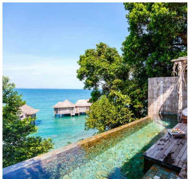
One bedroom jungle villa with infinity pool

Cambodia's Song Saa Private Island showcases a total of 24 luxury villas ( http://www.herworld.com/lifestyle/travel/best-top-luxury-resorts-within-singapore-malaysia-causeway-short-getaway-chinese-new-year ), split into 4 categories offering land and ocean views, which are made from recycled and reclaimed timber. Through this, the resort hopes to encourage sustainability of the environment.