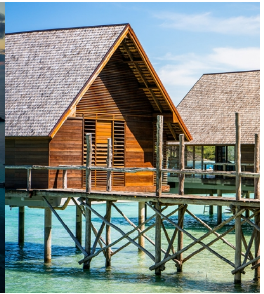
Exterior of overwater bungalows four

Located in the heart of the Indonesian Anambas, Bawah Island is a previously uninhabited marine conservation area. Guests are encouraged to experience nature through encounters with marine life such as corals, or by stepping into Bawah's forest which have been left to grow naturally. To promote the eco-friendly nature of Bawah Island, everything is crafted by hand and no heavy machinery is allowed.