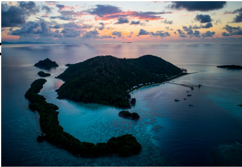
Bawah Island is a collection of 5 islands, 3 lagoons and 13 beaches