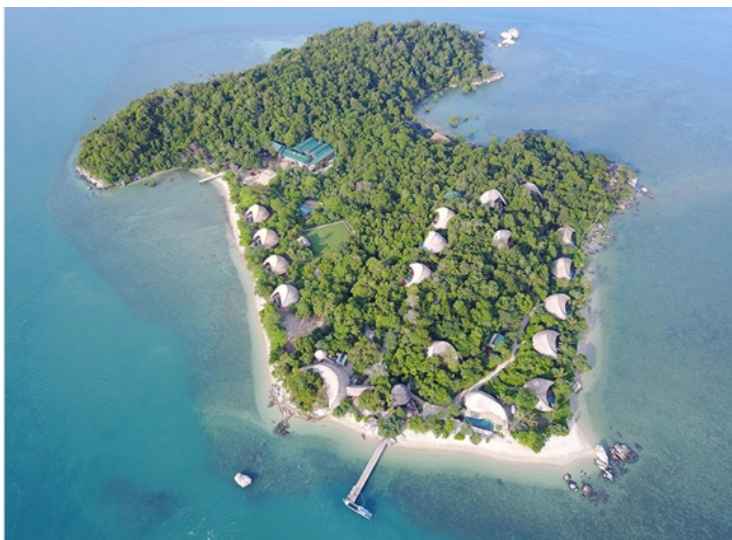
Cempedak Island, home to a total of 20 villas, is named after the native Indonesian fruit tree