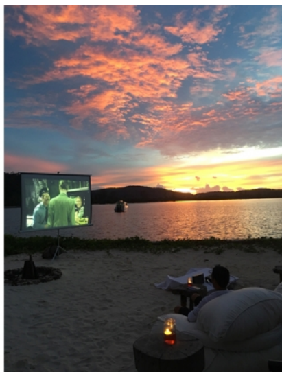
Outdoor movie theatre