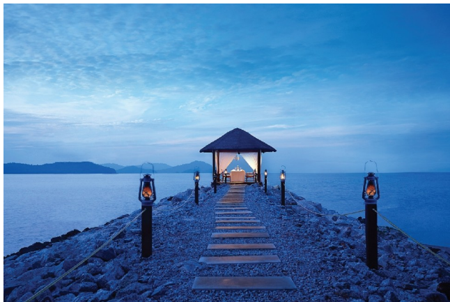
Vivanta by Taj, Malaysia.

Langkawi is arguably Malaysia's most popular island but most sun worshippers either flock to Cenang Beach or Tanjung Rhu. Skip those and head to this five-star resort that is floating on Rebak Island instead. Less than 30 minutes away from the airport, it is hidden behind 390 acres (157 hectares) of forested hills and stunning rock formations.