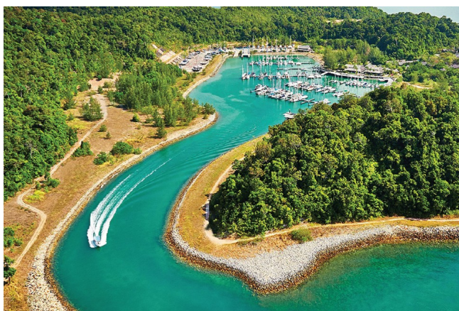
Vivanta by Taj, Malaysia.

Over here, there's a bit of everything for everyone. Like to break a sweat even while you're on vacation? There are complimentary nature walks and an exhaustive list of sport activities, including tennis, volleyball, yoga and biking. For those who want to experience marine life, opt for snorkelling, diving or a trip to Underwater World Langkawi back on the main island. When it's time to eat, you can either dine in at any of the eight restaurants and bars or choose from several private dining options around the island – we highly recommend the romantic Moon Deck, a wooden jetty where you can enjoy good food while overlooking the Senari Straits.