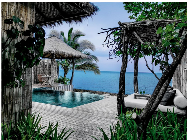
Song Saa, Cambodia.

Spread across two virgin islands, Koh Rong and Koh Oun, travellers will find within this natural oasis 27 thatched-roof suites designed using driftwood, bamboo and local stones, a gym, spa and overwater restaurant, plus a long list of complimentary activities.