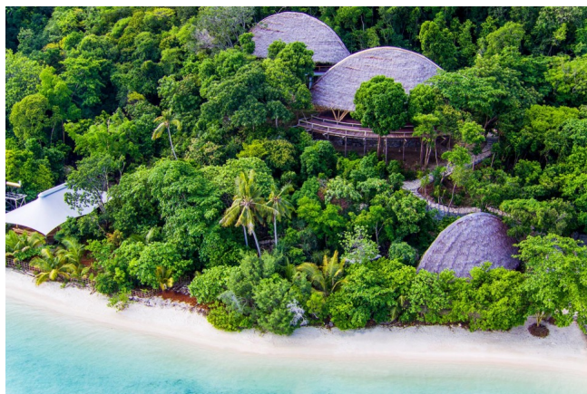
Bawah, Indonesia.

3.5 hours away from Singapore is this rustic-chic haven sitting within a collection of six islands, three lagoons and 13 powder white beaches that is only accessible via seaplane. If you think the 35 villas – 11 of which are overwater bungalows – made from recycled teak and local bamboo are impressive enough, just wait until you see the jellyfish chandeliers and an octopus-inspired décor made from discarded fishing line that enliven the main building.