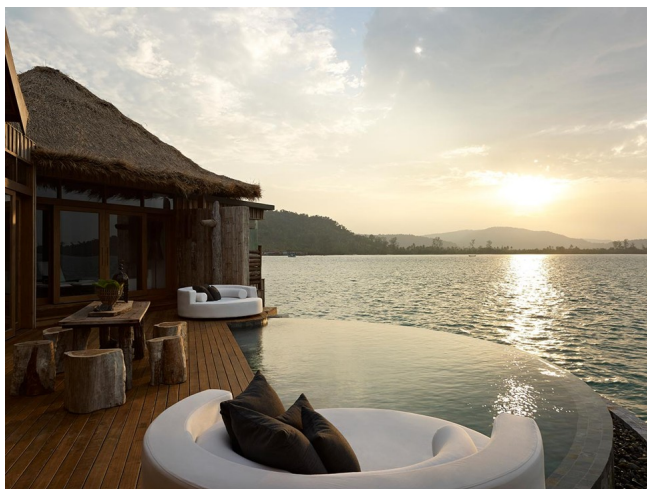
Song Saa, Cambodia.

Spread across two virgin islands, Koh Rong and Koh Oun, travellers will find within this natural oasis 27 thatched-roof suites designed using driftwood, bamboo and local stones, a gym, spa and overwater restaurant, plus a long list of complimentary activities.