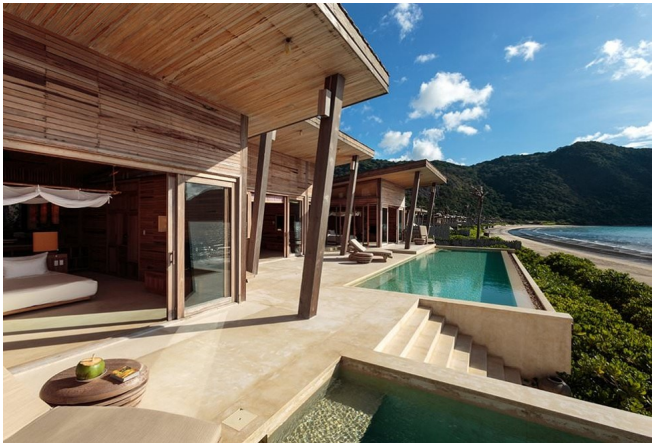
Six Senses Con Dao, Vietnam.

Imagine waking up to unobstructed breathtaking views of the sea and surrounded by tropical mangroves in one of the resort’s 50 eco-friendly villas. Oh, and did we mention that each villa comes with its own private infinity pool?