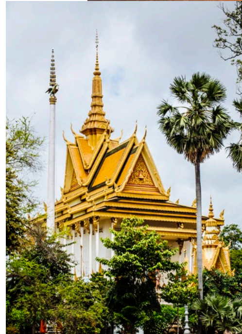
Clockwise from left: Crow's Beak Pagoda, outside Phnom Penh. An elephant at Angkor Wat. Monks at the Ta Prohm Temple. A rickshaw in Phnom Penh. The carved stone faces of Bayon Temple at Angkor Wat