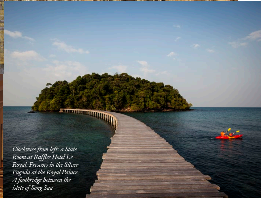
Clockwise from left: a State Room at Raffles Hotel Le Royal. Frescoes in the Silver Pagoda at the Royal Palace. A footbridge between the islets of Song Saa