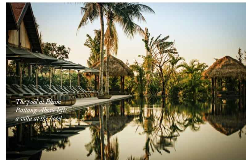
The pool at Phum Baitang. Above left: a villa at the hotel