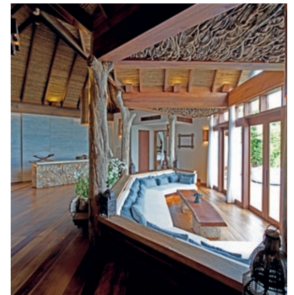
The entire property feels like the epitome of castaway chic, with local materials employed in the construction and the design

rounded off by all the creature comforts a castaway could only dream of: huge four-poster beds dressed in the finest linens, Moroccan lanterns, tribal carvings, oversized baths, private plunge pools, outdoor showers and private decks, to name a few. The two-bedroom jungle villa offers perhaps the most seclusion, perched atop the canopy of the surrounding rainforest, whilst the two-bedroom royal villa is the most indulgent, complete with its own private jetty and nary a boat within sight.