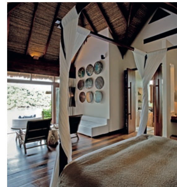
Each villa at Song Saa is its own private oasis, decked out in the finest linens, unique artwork and sleek furnishings