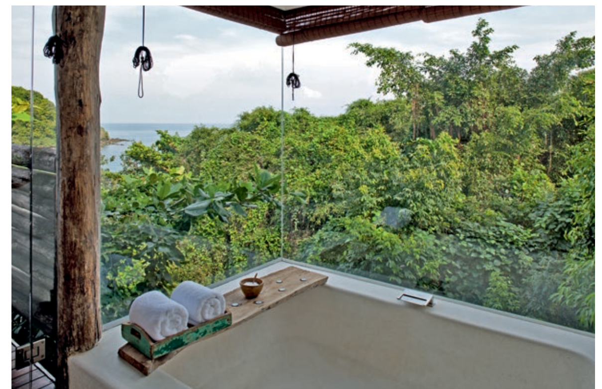
The two-bedroom jungle villa offers unparalleled privacy, located above the canopy of the rainforest

Twenty-seven thatch and stone villas dot the jungle or loll above the sea, each constructed from sustainable materials that harmonise perfectly with the natural surroundings without compromising design. Inspired by traditional Cambodian fishing villages, co-founder Melita Hunter chose to include natural elements such as rough-hewn natural timbers, thatched roofs, rustic timber beams salvaged from abandoned fishing boats and old factories and furniture made of driftwood collected from local beaches and coves. Each villa is