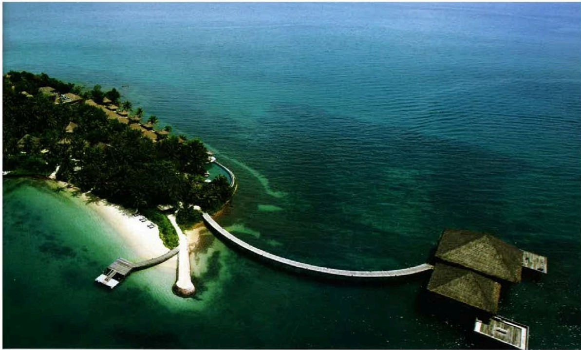
Clockwise from left: An ocean-view villa; an aerial view; and an unspoiled beach, all at Song Saa.