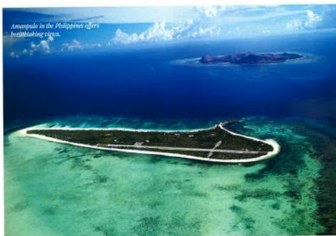
Amanpulo in the Philippines offers breathtaking views.