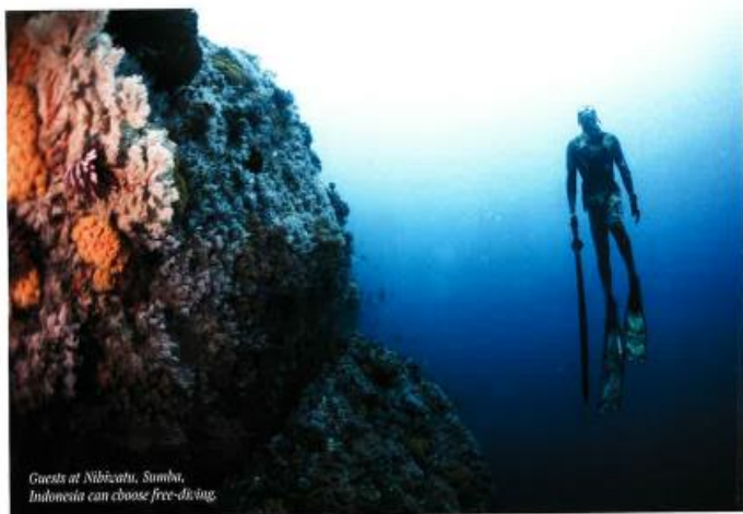
Guests at Nibisohi, Sumba, Indonesia can choose free-diving.

It's no surprise then that eco-tourism makes for