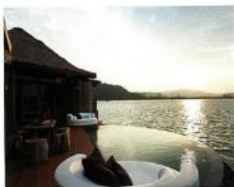
ABOVE Guests can relax by their exclusive two-bedroom villa at Song Saa Hotels and Resorts.