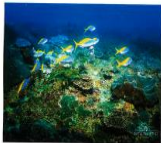
ABOVE Nabucatu, a resort available for exclusive use on remote Sumba Island in Indonesia, has amazing marine life.