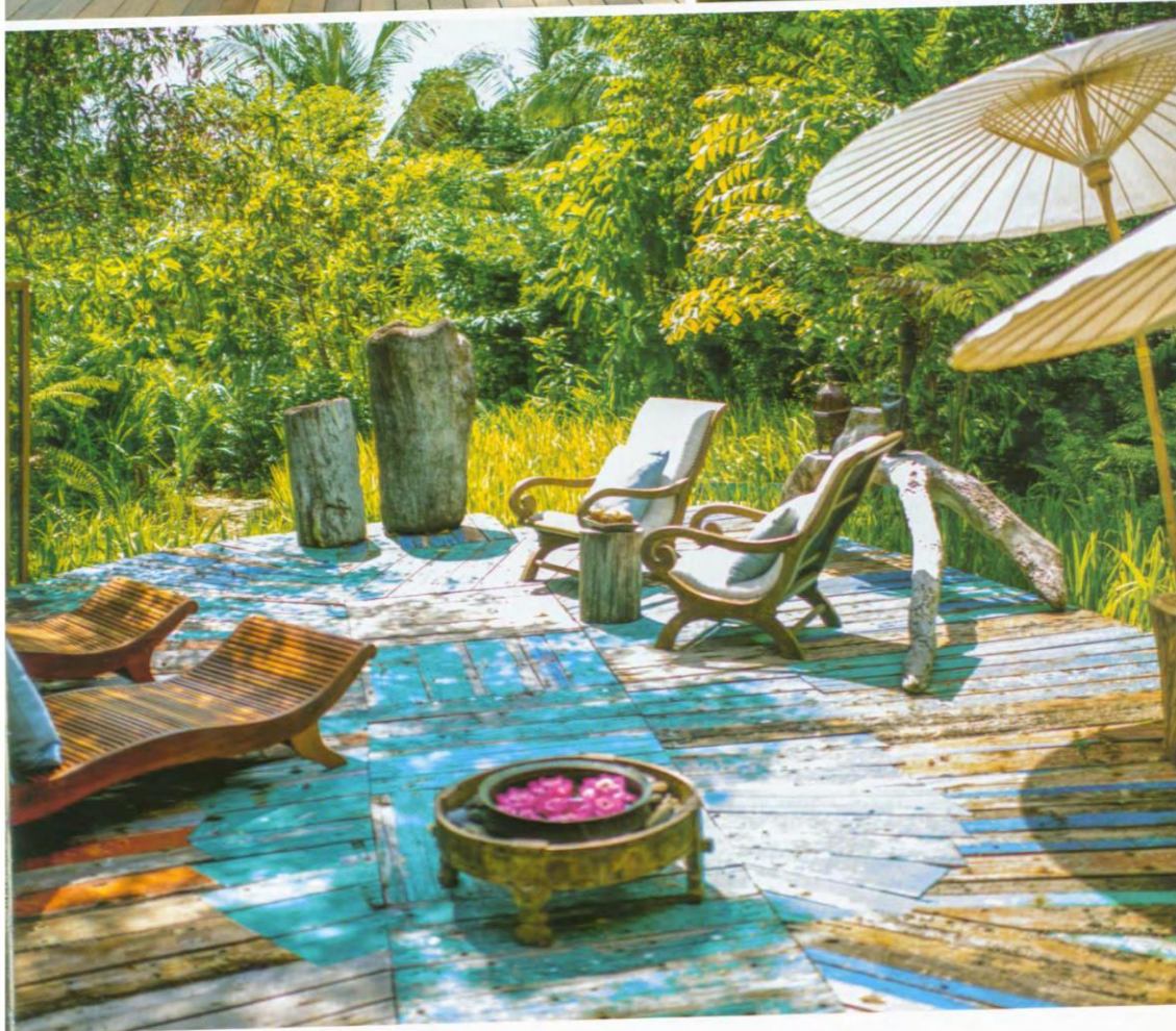
from left to right, from above to below: villa with pool, bedroom, terrace