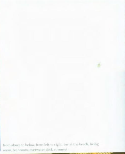
from above to below, from left to right: bar at the beach, living room, bathroom, overwater deck at sunset