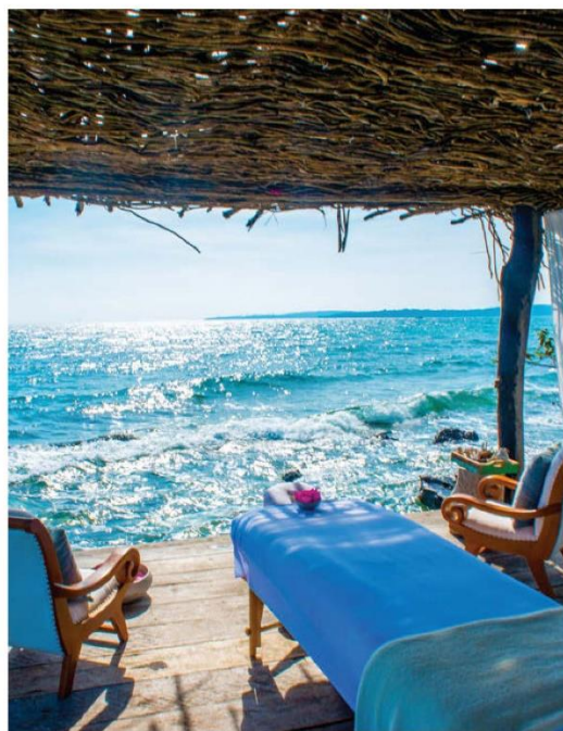
Indulge in a spa treatment.

Spotted a few years ago by Australian couple Rory and Melita Hunter, while exploring the region on their honeymoon, the two islands were bought with an eco-resort in mind. Committed to sustainable development, Rory and Melita wanted to create something that fitted with the environment and drew inspiration from the nearby fishing villages, while offering luxury and exclusivity. What transpired is a private island paradise like no other. Song