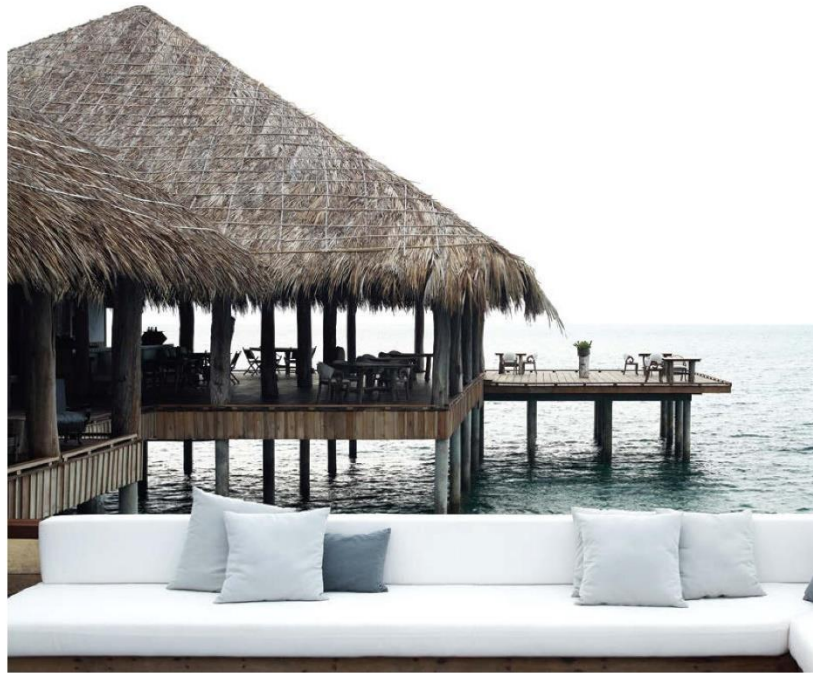
Dine while fish swim below.