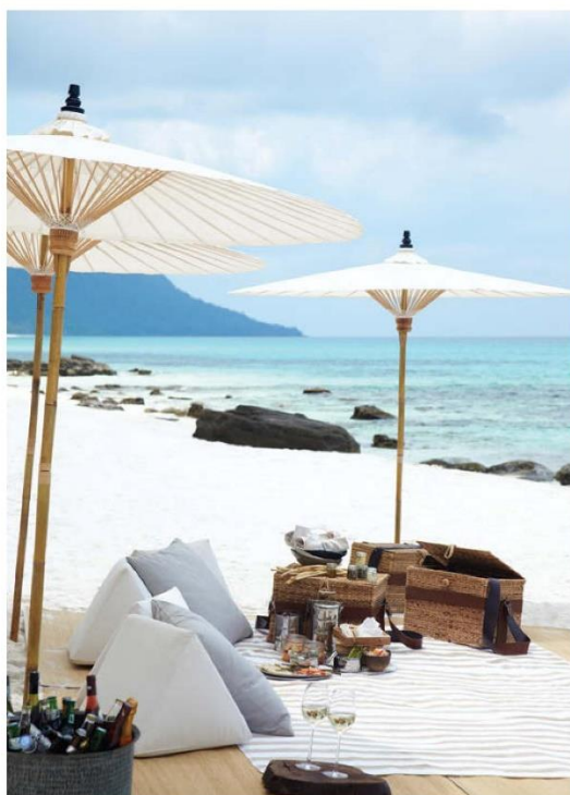
Picnic on a neighbouring island.