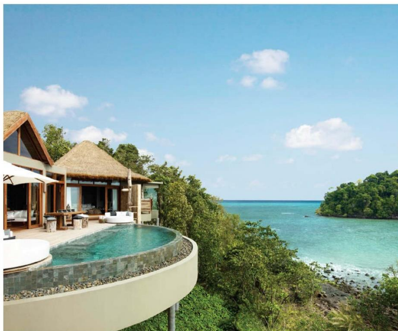
Plunge into your private pool.

While seclusion may be tempting, a stay wouldn't be complete without dining at the Vista Bar and Restaurant. Resting on stilts over the water, and accessed by a wooden bridge, this is the ideal place to sink a cocktail or two on one of the suspended daybeds while the sun sets. Come dinner time, experience the romance of fine dining at its best while gazing out to sea. If you are worried you'll be surrounded by other guests, well don't be – Song Saa has thought of everything.