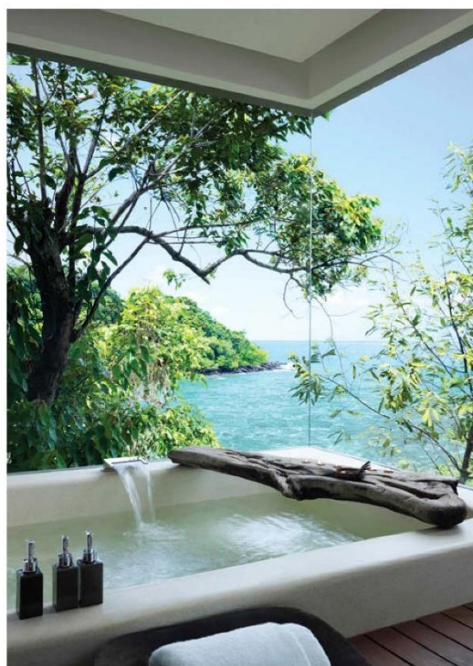
Enjoy a bath with a view.