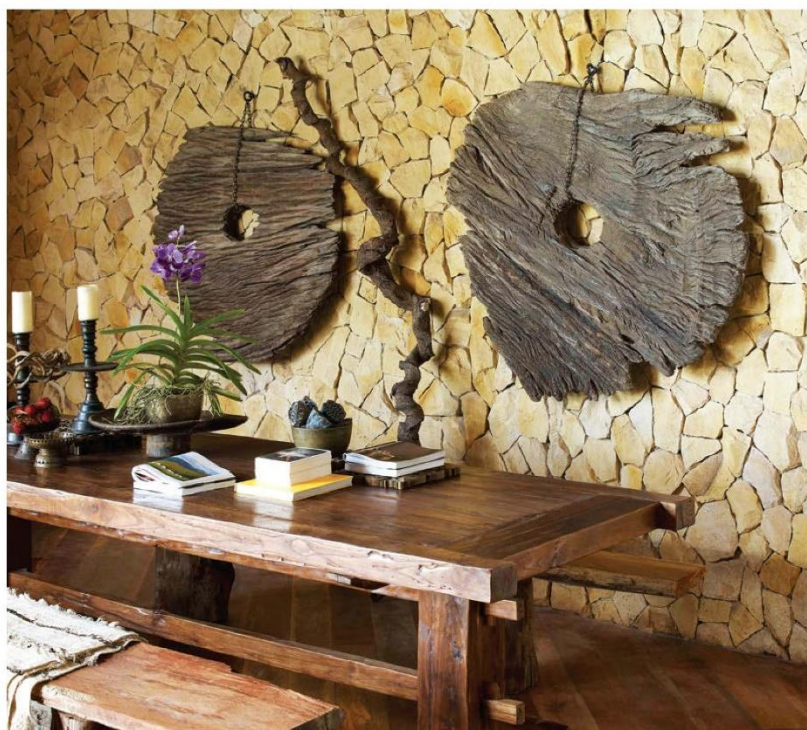
Marvel at the driftwood features.