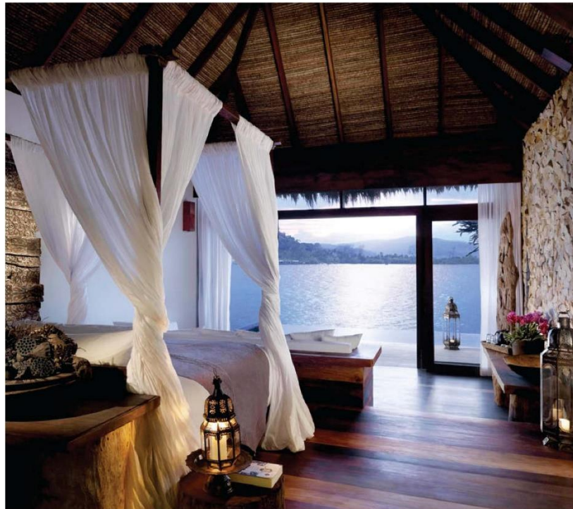
Gaze out to sea from your bed.